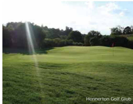
Hennerton Golf Club

Common limitations which restrict golf course development are steep slopes, rock or poor soil conditions, lack of suitable water, poor water quality, the need to conserve important natural habitats and public rights of way. For example, it may be that only 50 per cent of a site can be used because of extreme slopes or perhaps the soil is so poor that a massive drainage system is required which could be prohibitively expensive to install, thus making the development non viable.