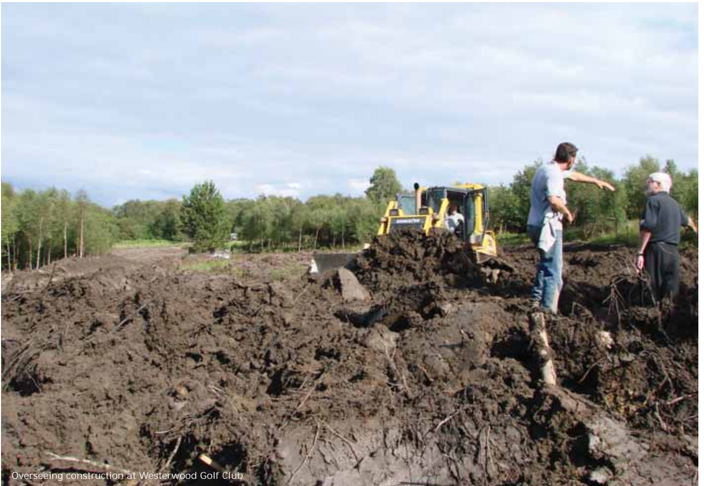
Overseeing construction at Westerwood Golf Club